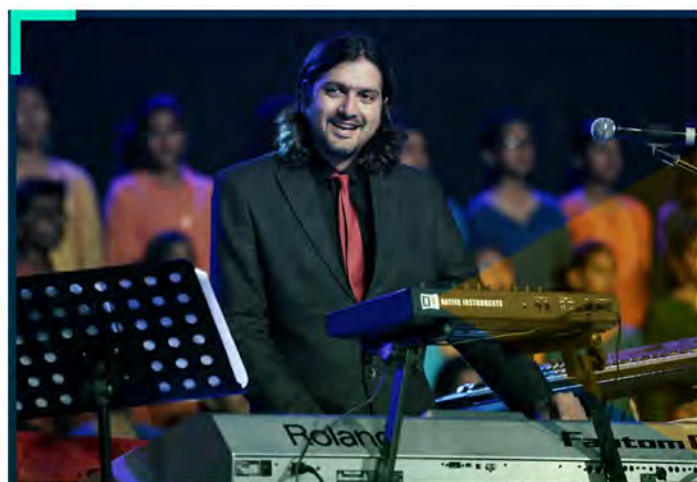
Live Entertainment Program preformed by Grammy award winner Ricky Kej.