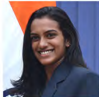
Ms. PV Sindhu - Indian Sports Personality