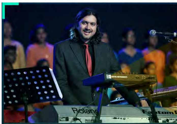
Live Entertainment Program preformed by Grammy award winner Ricky Kej.

India- Lebanon business meet on healthcare sector